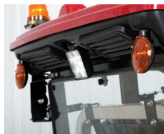
Optional Directional Flashers