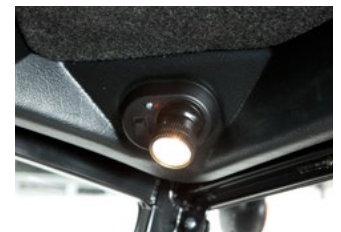
Standard Interior Light