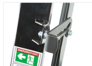
Standard Venting Windows