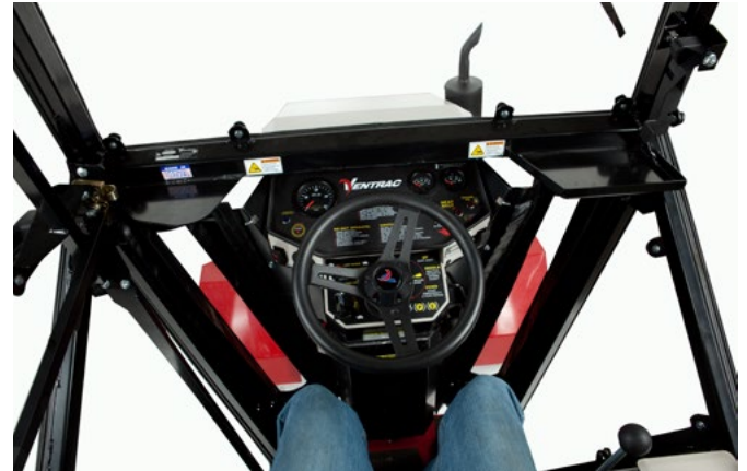
Exceptional visibility and interior room (shown with Spreader Control that comes with the SS575 Spreader)