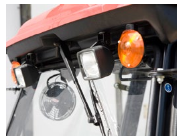
Standard Front Lights