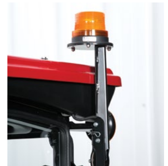
Optional Strobe Beacon