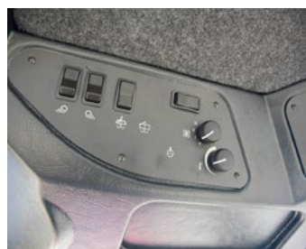
Switches conveniently located on ceiling