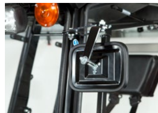
Optional Side Mirrors