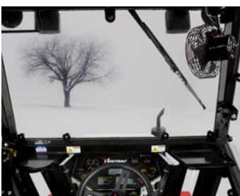
More interior room & exceptional visibility