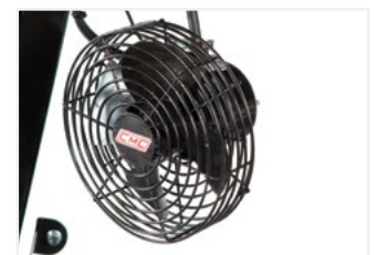
Optional Directional Defrost Fan