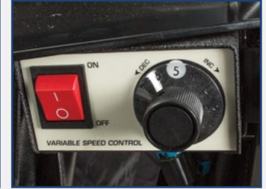
Electronic Control Box