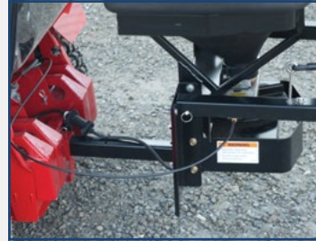
Mounting Kit on the 4000 series