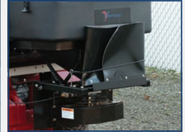
Drop Curtain flips up when not in use.